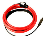
FSX-3 flexible clamp (fi 630 mm), output level 300 mV / 1 A WACEGFSX30KR