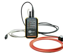
ERP-1 adapter with FSX-3 flexible clamp and case WAADAERP1V3