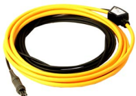
FS-2 flexible clamp (fi 1260 mm), output level 100 mV / 1 A WACEGFS20KR