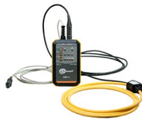
ERP-1 adapter with FS-2 flexible clamp and case WAADAERP1V2