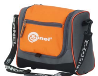
M6 carrying case WAFUTM6