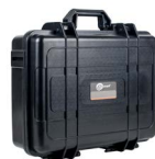
XL8 carrying case WAWALXL8